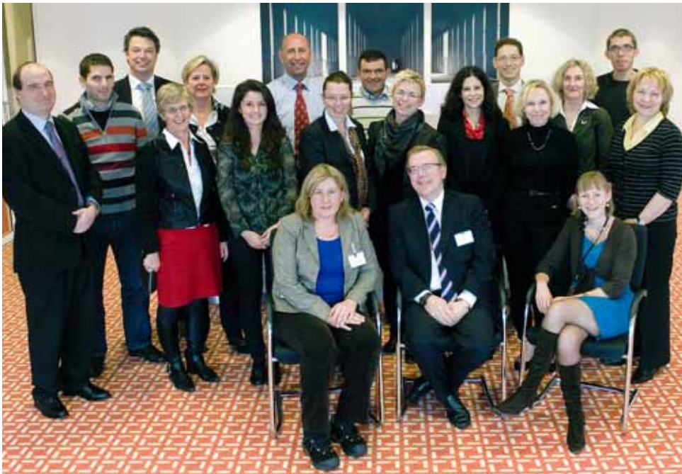
OOS in The Hague

The Quality and Competence Group also participated in the following meetings: European Cooperation for Accreditation Laboratory Committee (EA LC) meeting in Amsterdam March 2010, the BIPM Workshop “Metrology for Forensic Science- Chemical and Biochemical Analysis” in Paris April 2010 and the Forensic Regulators meeting in Birmingham UK, February 2010.