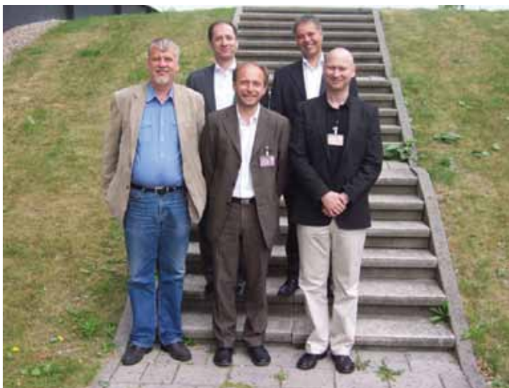
ENFSI's 14th Board