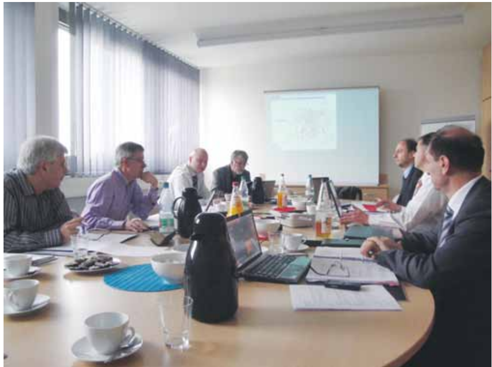
Discussion by the Board