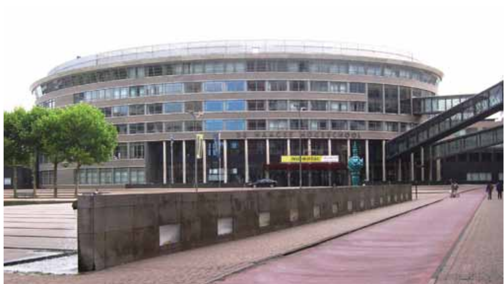
Meeting venue EAFS 2012

In the course of 2010, the local organisers of the EAFS Triennial Conference 2012 in The Hague took on a lot of preparative activities. The conference title (Towards Forensic Science 2.0) was selected, the scientific themes were set, the fund raising process has started, the venue was chosen, etc.