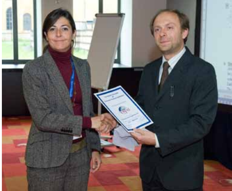
Handing over the ENFSI Membership's Certificate

Two member-institutes left ENFSI in 2010: