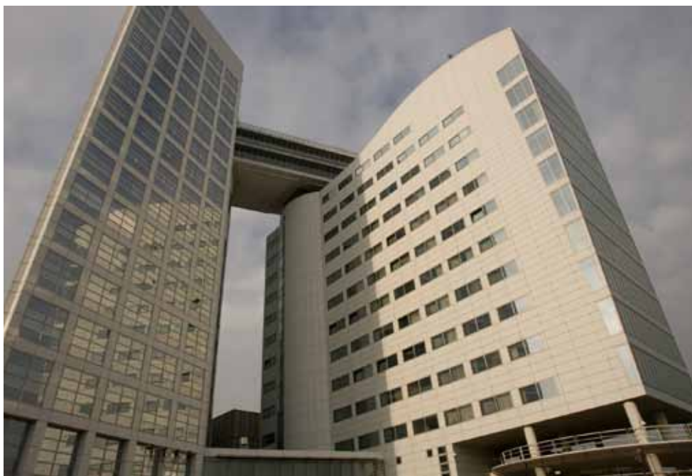
Eurojust/ICC offices in The Netherlands