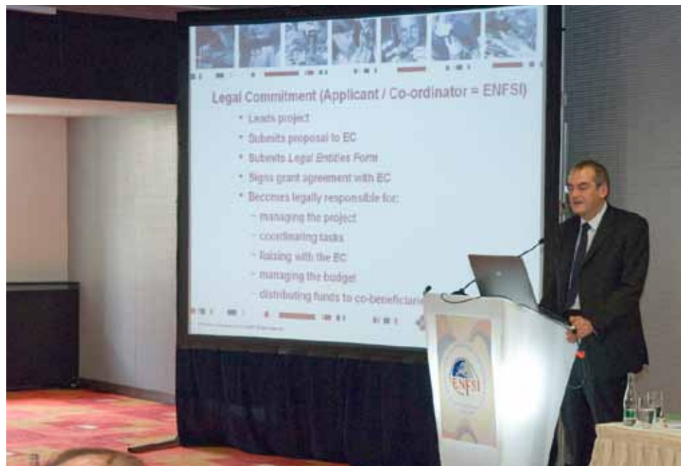
Presentation on the Monopoly Program

As usual the meeting was divided into a thematic part and a business meeting. ‘Future of ENFSI’ was the theme of the Thematic Part. This theme was progressed by membership in three discussion groups focusing on the following topics: Membership Categories, Monopoly Program and Relations between WG’s - Board – Directors. The outcomes were then discussed in a plenary session.