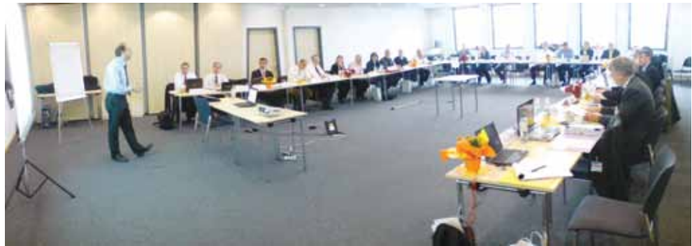
The Working Group Chairs meet with the Board (Wiesbaden)