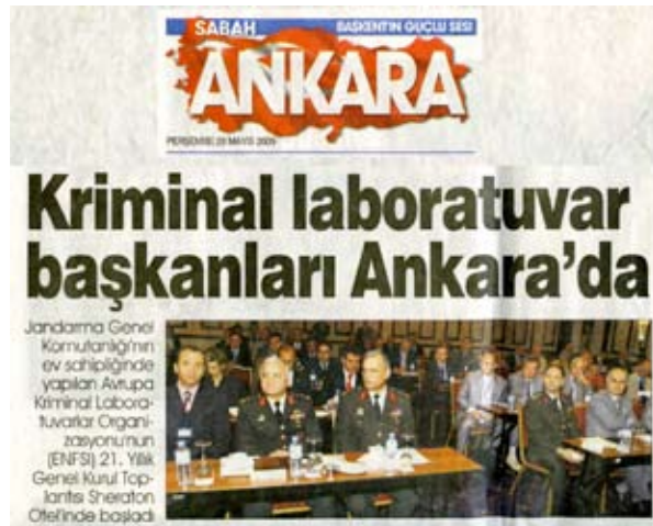
Annual Meeting Ankara – Newspaper attention