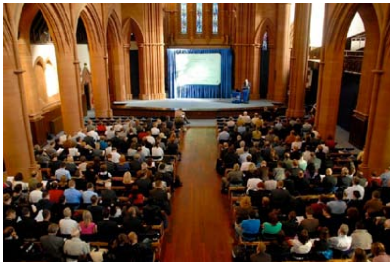
Plenary opening session

The proceedings of the conference were published in a special issue of Science & Justice in March 2010.