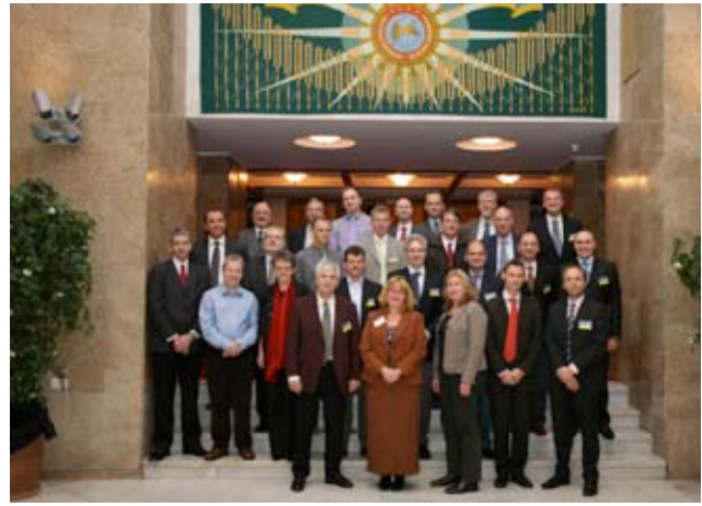
Participants in front of the meeting venue

In 2009 three One day, One topic Seminars (OOS) have been organised focusing on current and strategic topics.