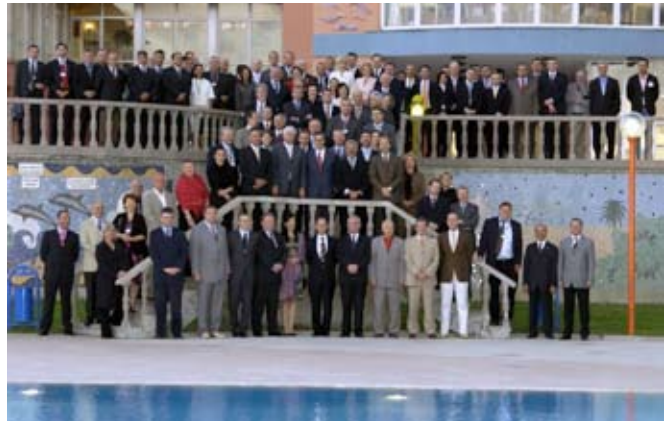
Annual Meeting Ankara – All participants