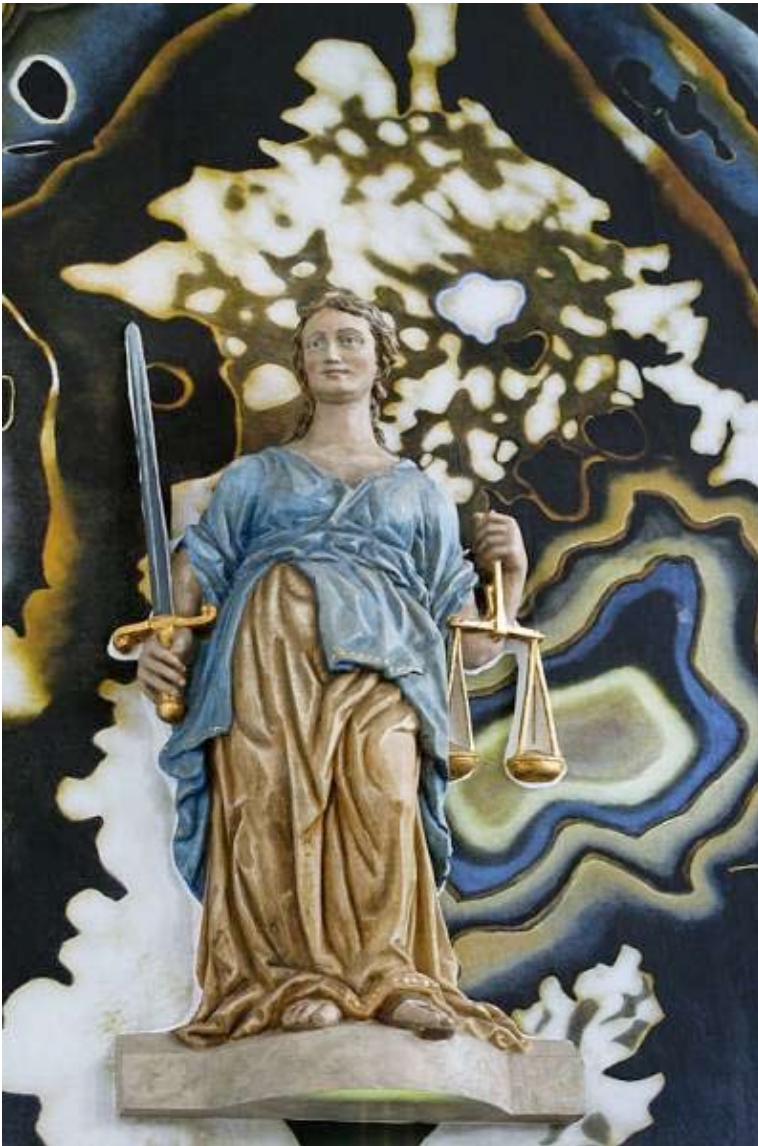
Lady Justice [unknown artist, 17th century]

The aim of ENFSI is to ensure that the quality of development and delivery of forensic science throughout Europe is at the forefront of the world*