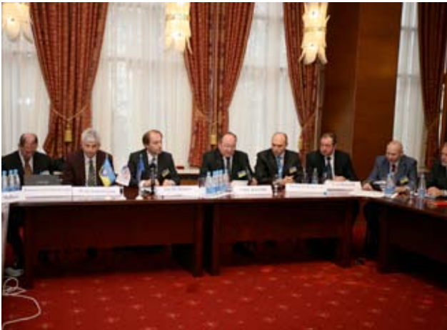
Opening address of the Joint Meeting.