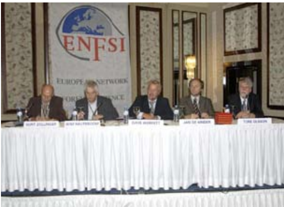
Annual Meeting Ankara – The 12th ('old') Board

The meeting ran from May 26 – 28th at the “Sheraton Hotel & Convention Centre” in Ankara. The Thematic Part – traditionally on the first day –focused on ‘Casework management’, a classical issue in the forensic community. The invitation of 3 Expert Working Group Chairs who gave updates of the recent developments in their respective Working Groups was a new departure for the AM.