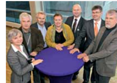
FEPG Members during the Joint Meeting in the Hague

Future of ENFSI Project Group (FEPG), founded during the Annual Meeting in Prague in 2010, continued its challenging work also throughout 2011. To facilitate the work of the group, all meetings of FEPG were timely and geographically linked to ENFSI Board meetings.