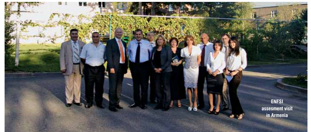
ENFSI assessment visit in Armenia