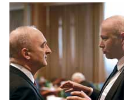
ENFSI and EA Chairs discussing future cooperation during EA General Assembly 2011.

The next IFSA meeting is planned to take place in Australia on 23-27 September 2012 and will also be attended by ENFSI representatives.