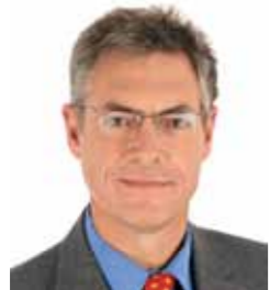
Ingo Röder, Director of the Department of Forensic Science

The Department of Forensic Science (LKA 3) is a part of the State Criminal Investigation Office Hamburg (LKA HH), which belongs to the police of Hamburg. LKA 3 is the only department of forensic science of the police in Hamburg land. The forensic department employs nearly 195 people and is responsible for forensic science and technology through offering these services for the police units as well