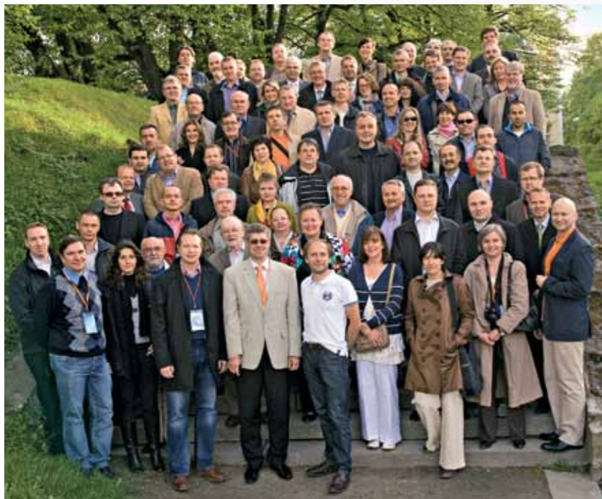
Participants of ENFSI Annual Meeting 2011 in Tallinn, Estonia

The ENFSI Annual Meeting 2011 was held in Tallinn from May 25 – 27, 2011 and hosted by the Estonian Forensic Science Institute (EFSI). According to ENFSI tradition, it consisted of a one-day Thematic Part followed by a two-day Business Meeting.