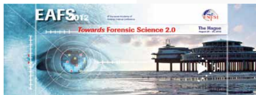
Official Logo of EAFS 2012