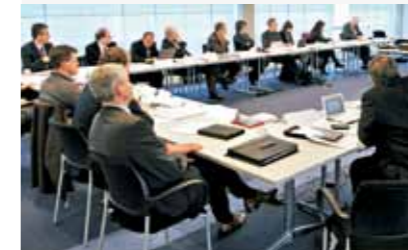
ENFSI Joint Meeting 2011, the Hague

The 2011 Annual Meeting when the Board met the chairs of the Working Groups, also referred to as Joint Meeting, was hosted by the Netherlands Forensic Institute and held in the NFI Field Lab on 1 and 2 December 2011. Discussions focused in particular on the Future of ENFSI and future role of ENFSI Working Groups in creation of