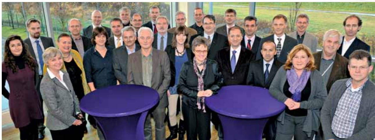
WG representatives during ENFSI Joint Meeting held in the Hague

16 ENFSI Working Groups comprise a substantial number of professionals involved in various ENFSI activities. They were created in order to exchange information, develop best practices, establish standards and exchange forensic data. In 2011, all the groups continued their successful forensic work. Their main activities were mainly related to organisation of proficiency tests/collaborative exercises within ENFSI and preparation of best practice manuals as well as organisation of forensic workshops. The European