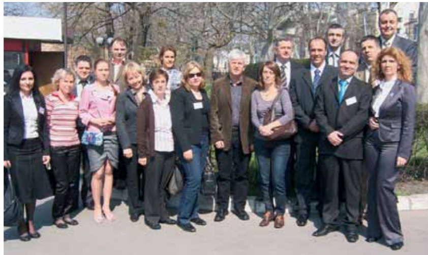
EMFA-2 Participants of opening Conference in Belgrade

The participants of EMFA-2 comprise four twin pairs. Each of them consists of a trainee and a mentor (already accredited) laboratory. The paired ENFSI laboratories originate from Serbia – Croatia, Montenegro – Estonia, Russia – Latvia as well as Bosnia and Herzegovina – Slovenia.