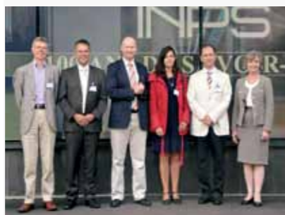
Participants of the Board Meeting in Lyon

In 2011, ENFSI Board held six meetings taking place in various venues in Europe. The number of organised meetings proved itself to be sufficient to guarantee an effective management of ENFSI. The meetings gave the Board an opportunity to address internal problems as well as adopt a common position on issues of strategic character. In general, there were many issues raised and settled during the meetings. The Board focused, among