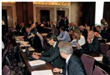
ENFSI Member- representatives at the AM2014 held in Bratislava, Slovakia.

Other topics discussed in Bratislava touched upon ENFSI finances, Expert Working Groups, new internal website for ENFSI, cooperation with CEN/TC 419 and European Academy of Forensic Science to take place in Prague, Czech Republic, in September 2015. Thanks to the Slovak organisers, the meeting was characterized by a pleasant atmosphere favourable to fruitful discussions. The next Annual Meeting of ENFSI will take place in Pontoise, France in May 2015.