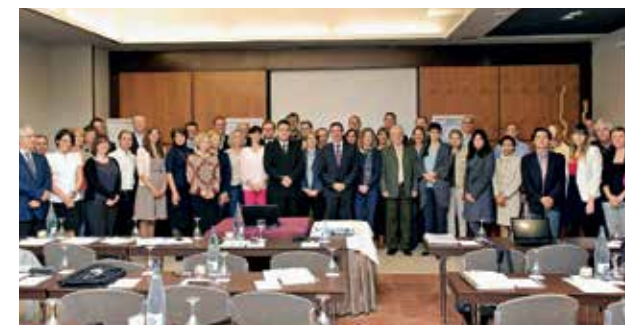
Participants of QCLG Conference held in Barcelona, Spain, in November 2014.

In addition to the above, throughout the last year, the QCC continued its involvement in the HOME/2012/ISEC/MO/4000004278 Monopoly Programme entitled "Towards European Forensic Standardisation through Best practice Manuals" (TEFSBPM). The QCC activities within this scope included, among others, meetings with Project Teams involved in drafting Best Practice Manuals. The Committee played a leading role in organising the Open and Mid-term conferences of the MP2012 Programme and in supervising the overall progress in the Programme. This support will continue in 2015. The ENFSI Quality and Competence Liaison Group (QCLG) had its annual meeting in Barcelona (Spain). This was held in conjunction with the Mid-term conference organised under the MP2012 Programme. The