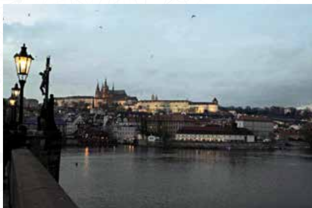
The Beauty of Prague - Hosting City of EAFS2015.

Prague, the capital city of the Czech Republic, lies in the heart of Europe and ranks amongst the most impressive historical cities in the world. Prague is easily accessible from all major European cities. The Prague Congress Centre is well equipped venue, located in a unique position on top of one of the Prague hills. It offers a beautiful view of the famous skyline of Prague, with the silhouette of the Prague Castle. The main meeting room, the exhibition and poster areas will be located on the one floor so delegates and exhibitors will have lot of opportunities to meet.