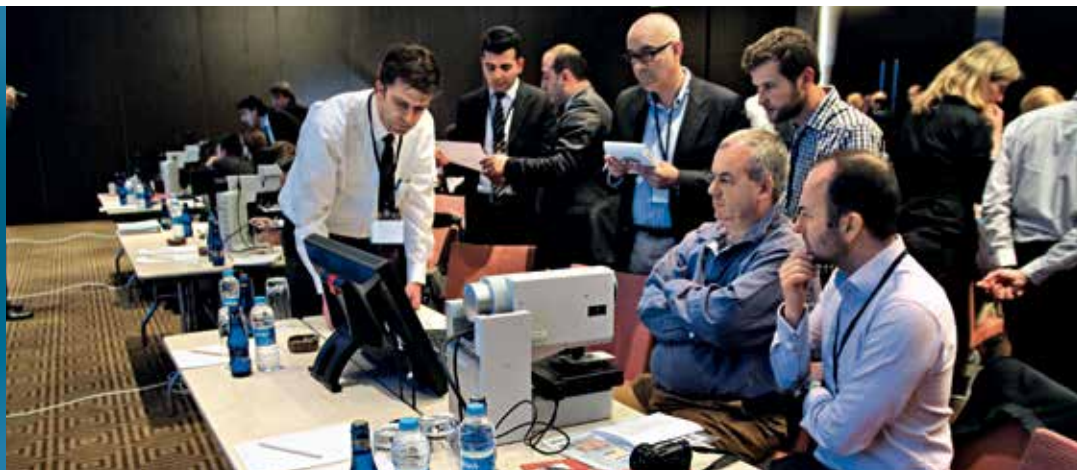
The Annual Meeting of Handwriting Expert Working Group.