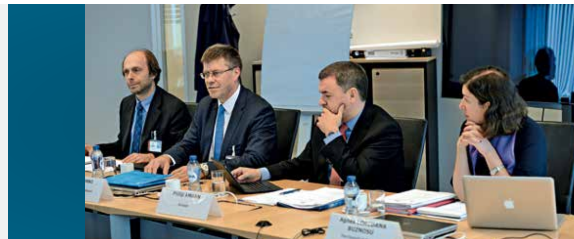
Tripartite Meeting of ENFSI, Europol and Eurojust.