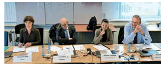
Tripartite Meeting of ENFSI, Europol and Eurojust.