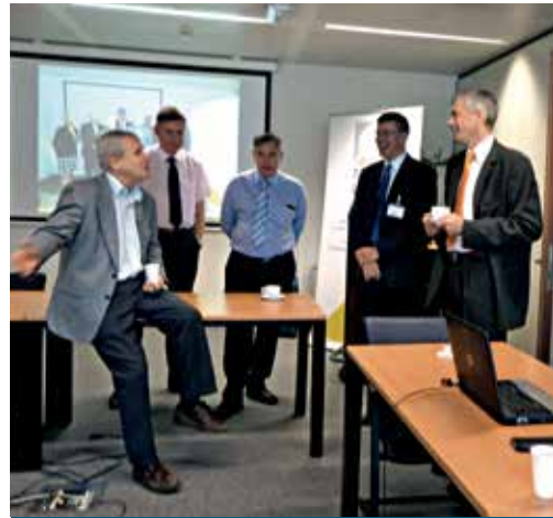
On the right: Members of R&D SC during a discussion in Brussels.