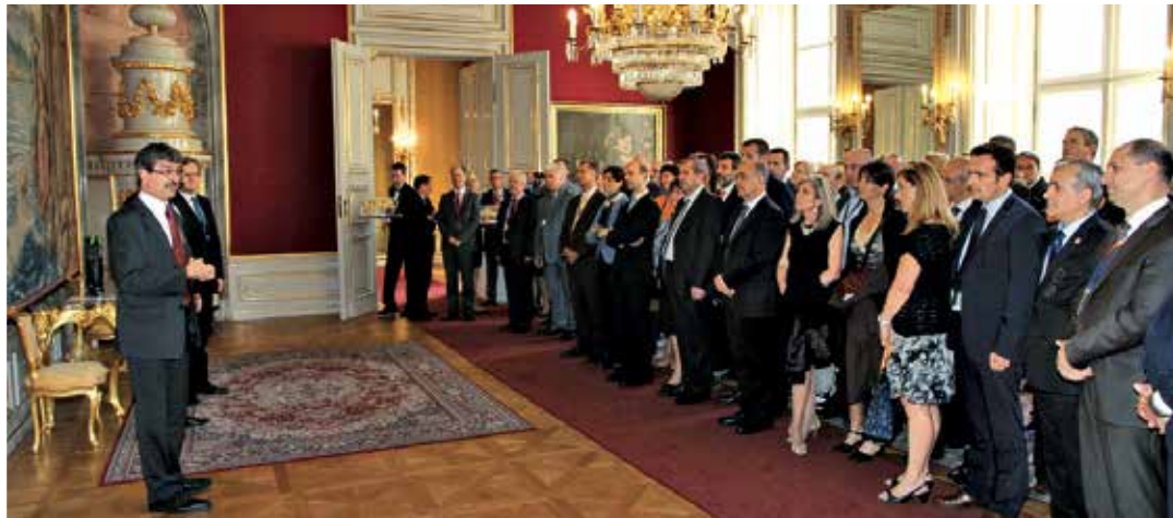
On the Left: Official Dinner held during Joint Meeting 2014.