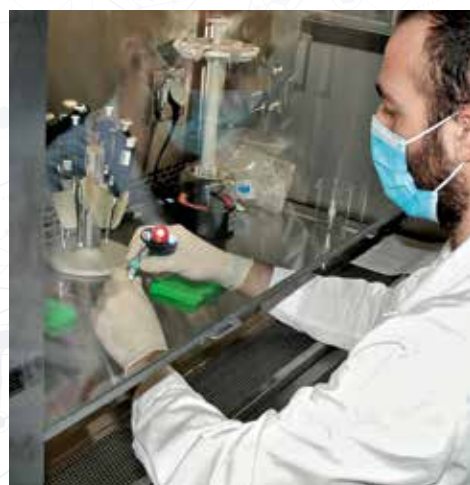
Scientific Work at FSD.