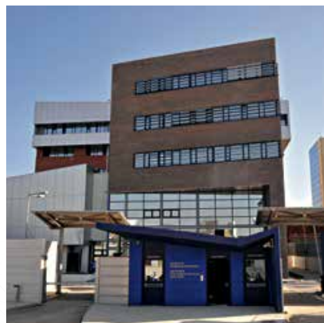
FSD Headquarters Located in Athens, Greece.