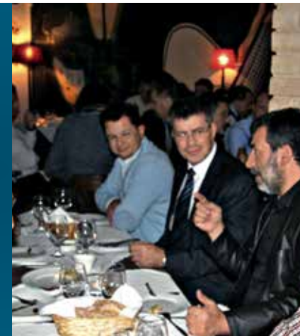
On the Right: Participants of London Board Meeting.