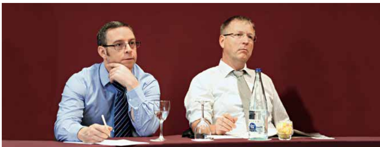
Participants of the MP2012 Mid-term Conference held in Barcelona, Spain.

With the financial support of the Prevention of and Fight against Crime Programme European Commission – Directorate-General Home Affairs