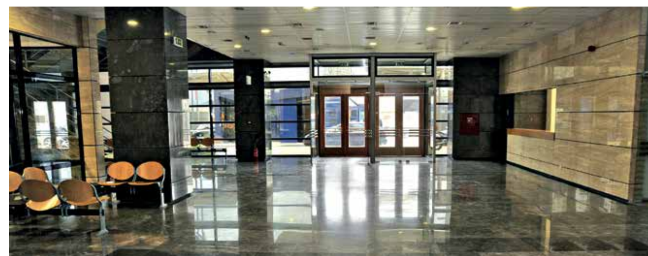
FSD Premises Located in Athens, Greece.